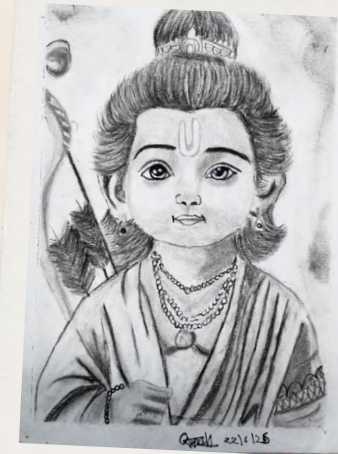
AYUSH CLASS VI