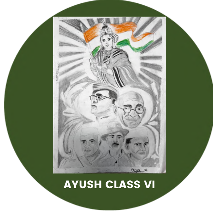
AYUSH CLASS VI