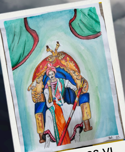
YASH CLASS VI