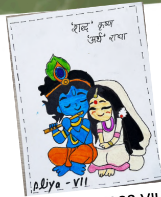
AALIYA CLASS VII