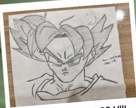
VIRAT SHUKLA CLASS VIII