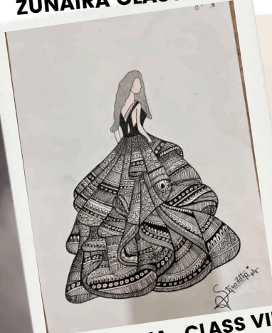
SHRADDHA- CLASS VIII